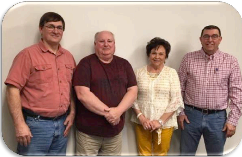
2019 - 2020 Executive Board Officers